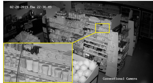
Unable to identify color