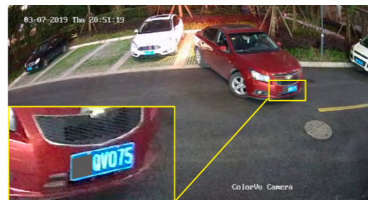
Rich color-related details