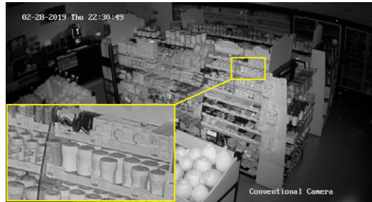
Unable to identify color