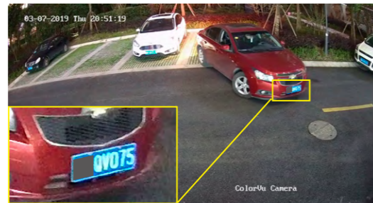
Rich color-related details